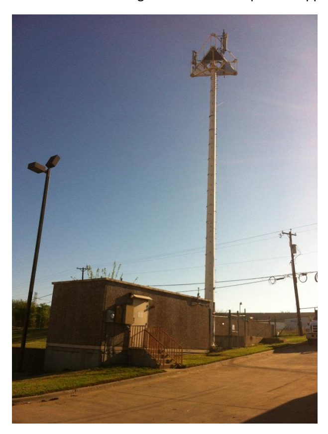
View of Tower from southern edge of lot