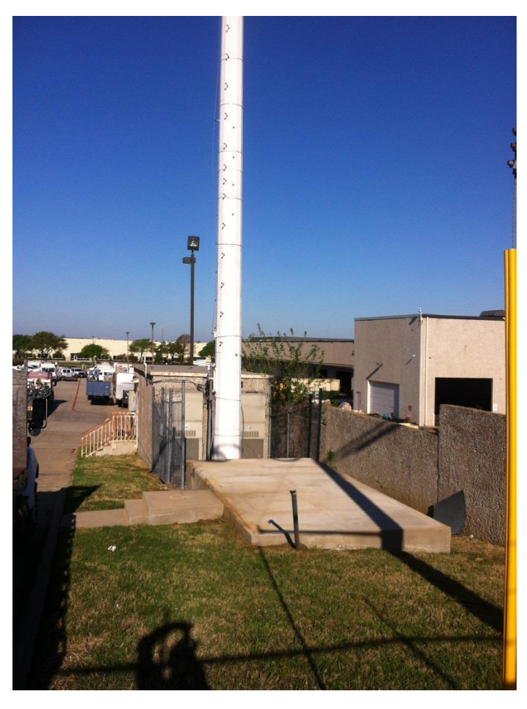
View of 20'x 70' Tower base compound –location of new sheds