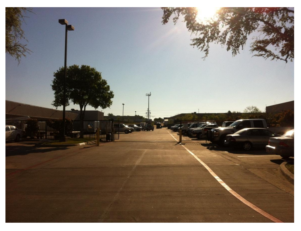
View of Tower looking eastward from Diplomat-Approximately 600 feet away