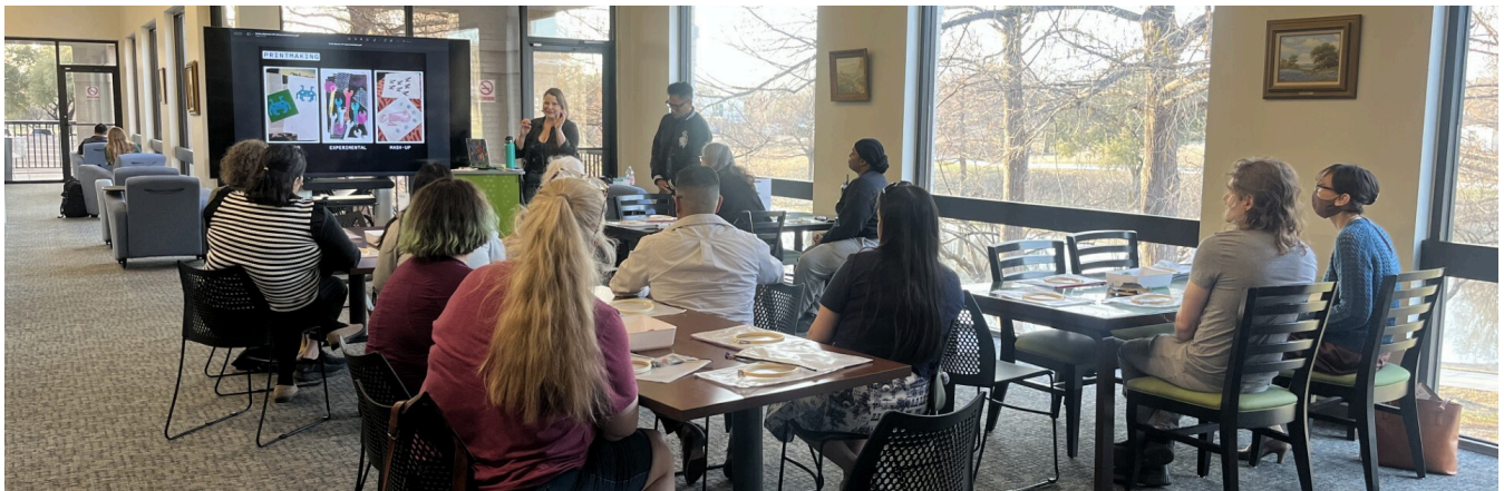
Adults learn how to create Light Up Embroidery artwork at a "sold out" session on February 25th.