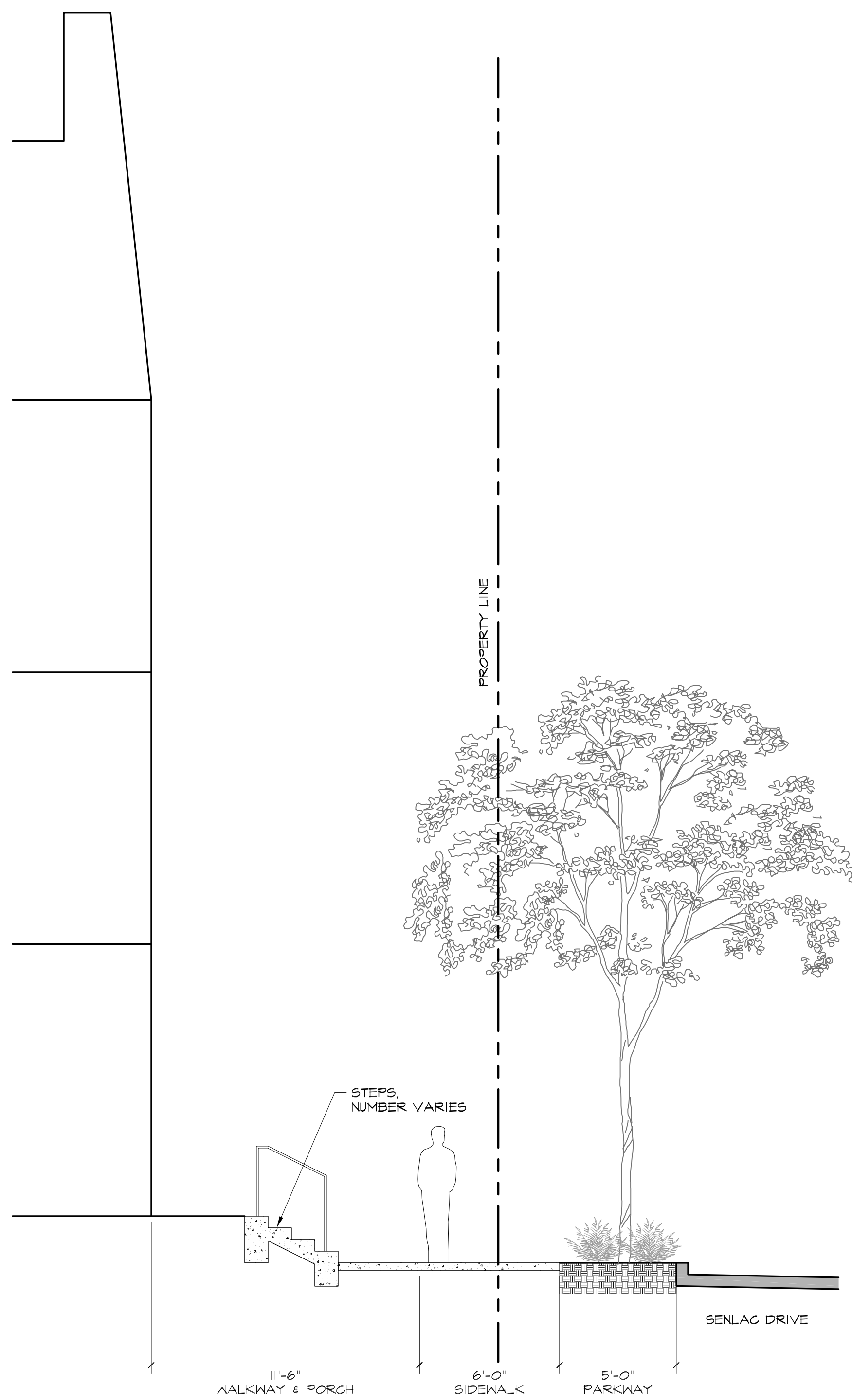
Senlac Drive Section B