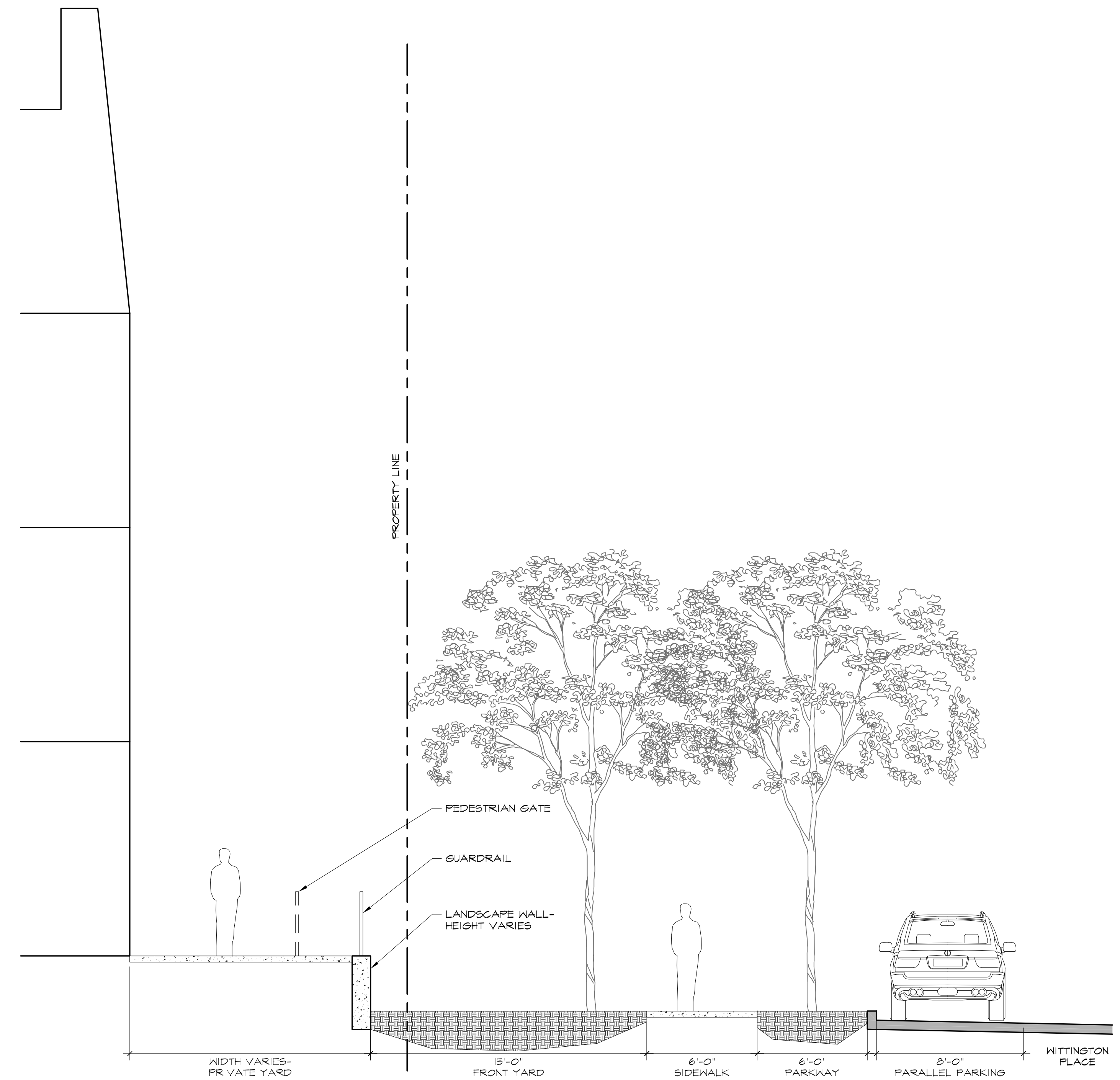
Wittington Place Section | E