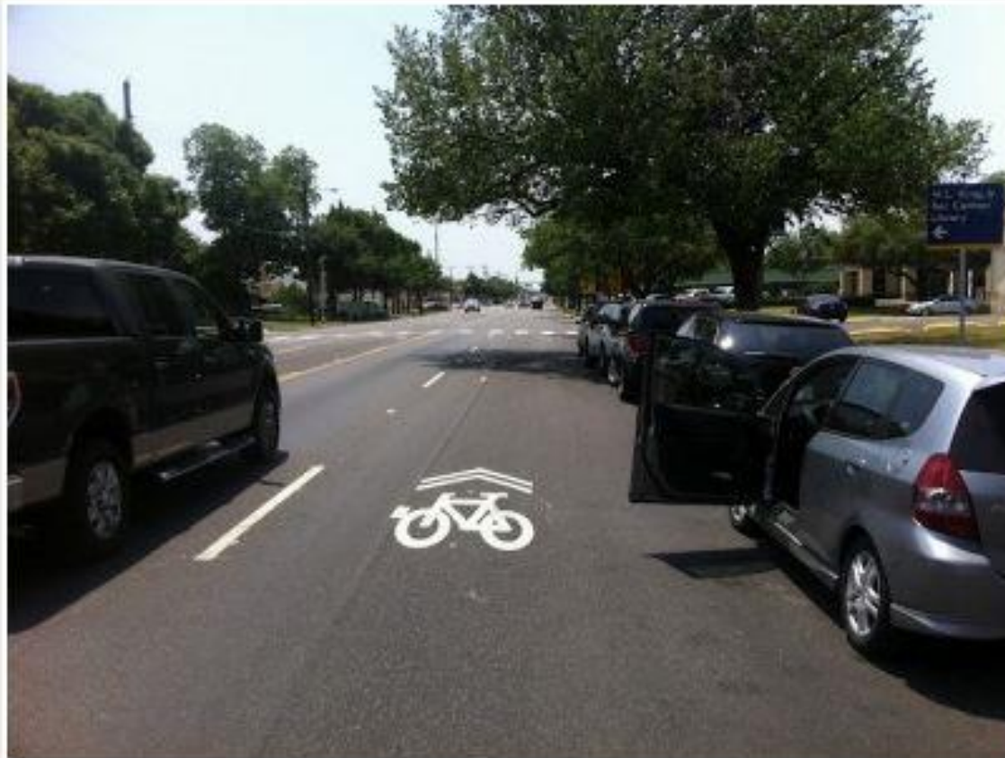
Properly Placed Sharrows on MLK Blvd