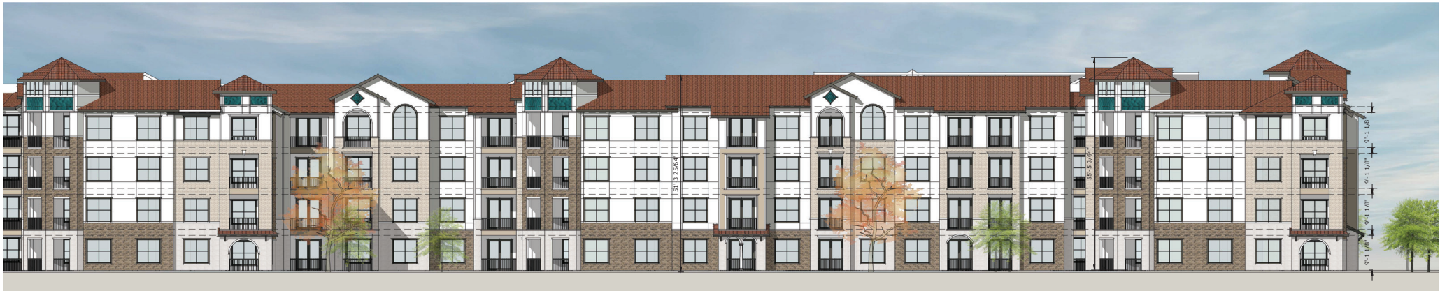
SOUTH ELEVATION SCALE: 3/32