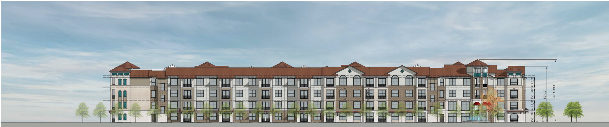
WEST ELEVATION SCALE: 1/16" = 1'-0"