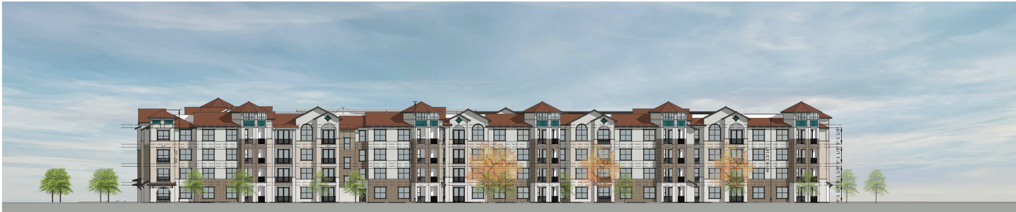
EAST ELEVATION SCALE: 1/16" = 1'-0"