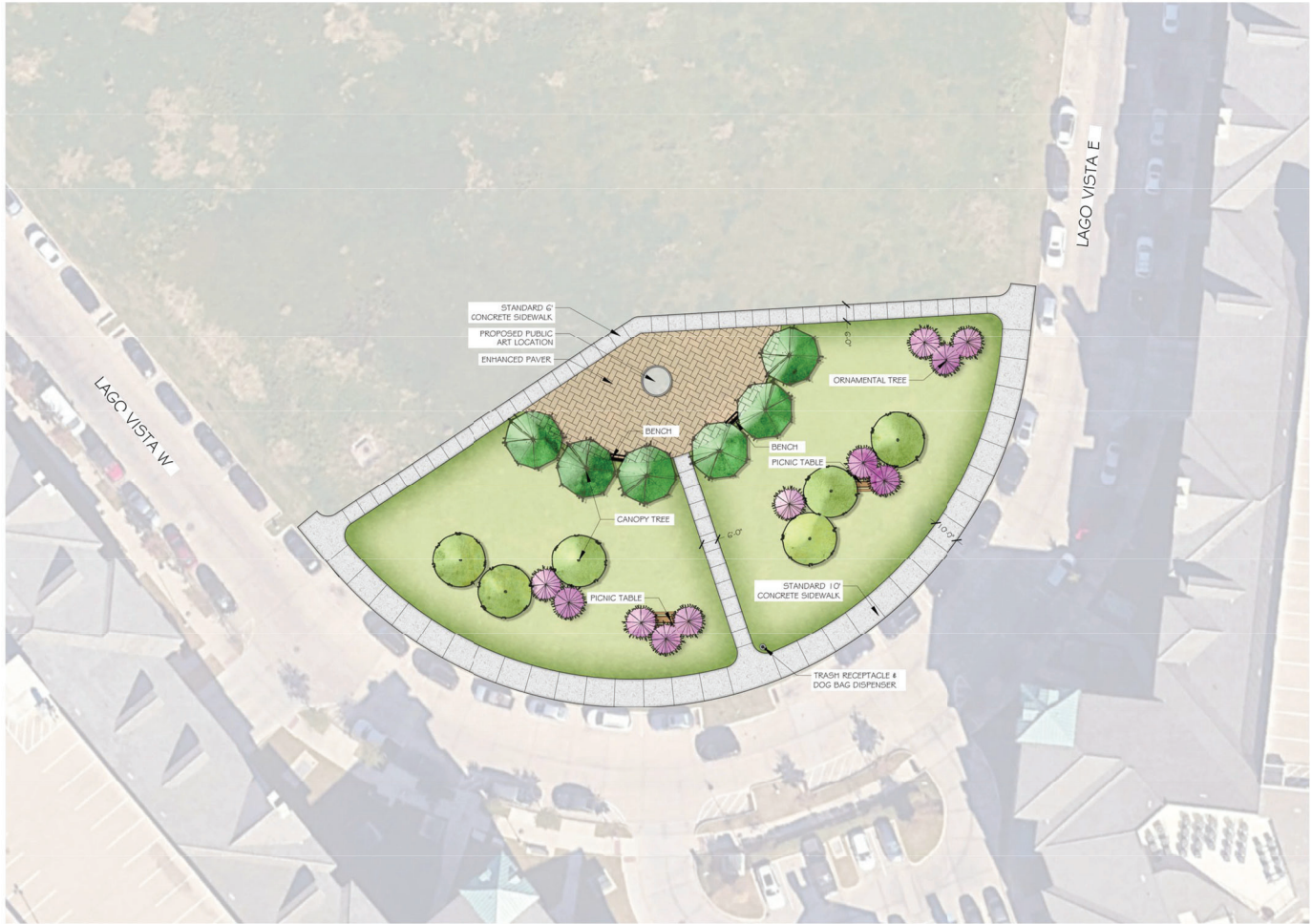
1 POCKET PARK CONCEPT 1" = 20'-0"