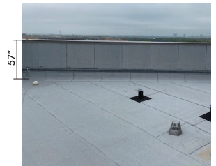
ROOF TOP PARAPET

ELECTRICAL CONDUIT TO PENETRATE ABOVE CEILING & BELOW ROOF