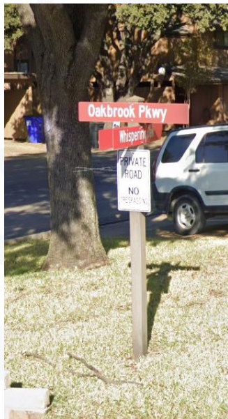
Whispering Oak at Oakbrook