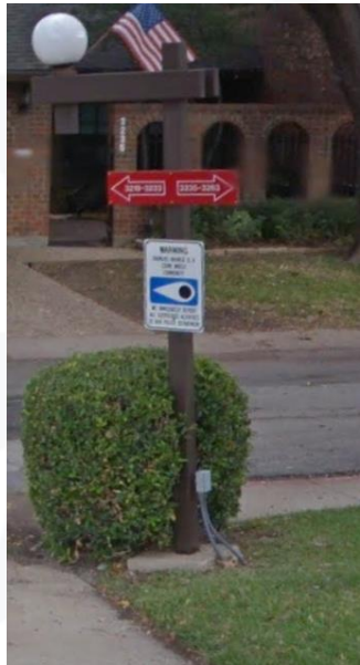
Whispering Oak at Whispering Oak