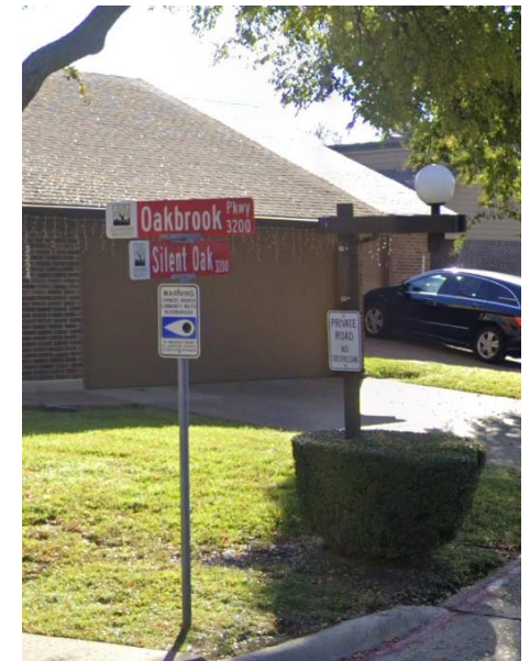
City Sign Blades at Silent Oak at Oakbrook (near electrical/lights)