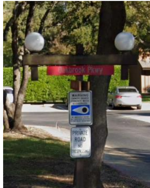
Golden Oak at Oakbrook with electrical/lights