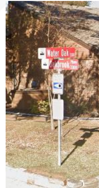
City Sign Blades/Pole at Water Oak at Oakbrook