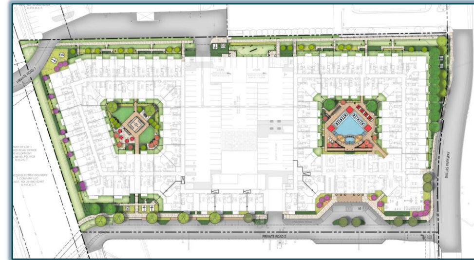
22% Site Coverage

All Frontages: One large shade tree for each 25ft of frontage.