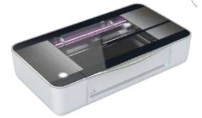
Glowforge Laser Cutter Reservations Available