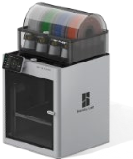
3D Printer Reservations Available