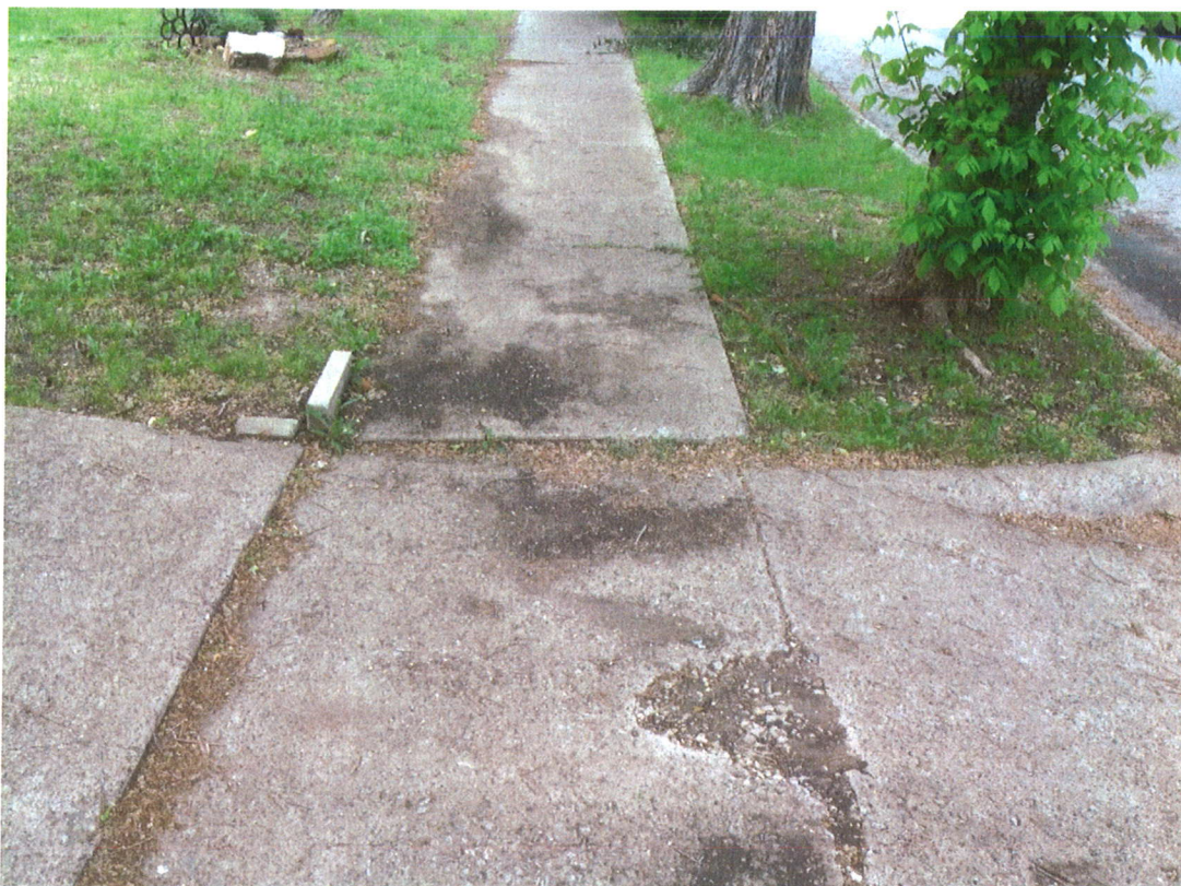
Multiple pavement cuts and sunken pavement