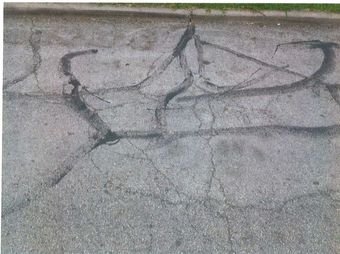
Multiple cracks with pavement faults