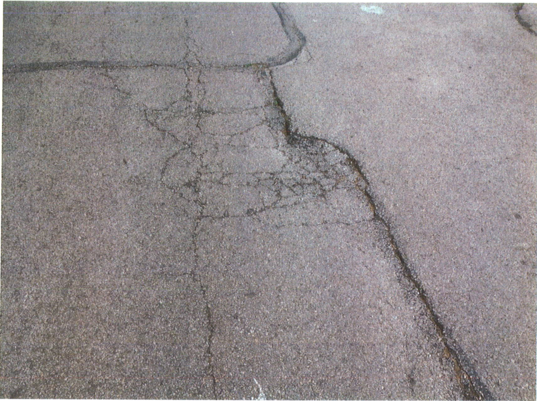
Asphalt raveling with pavement faults underneath