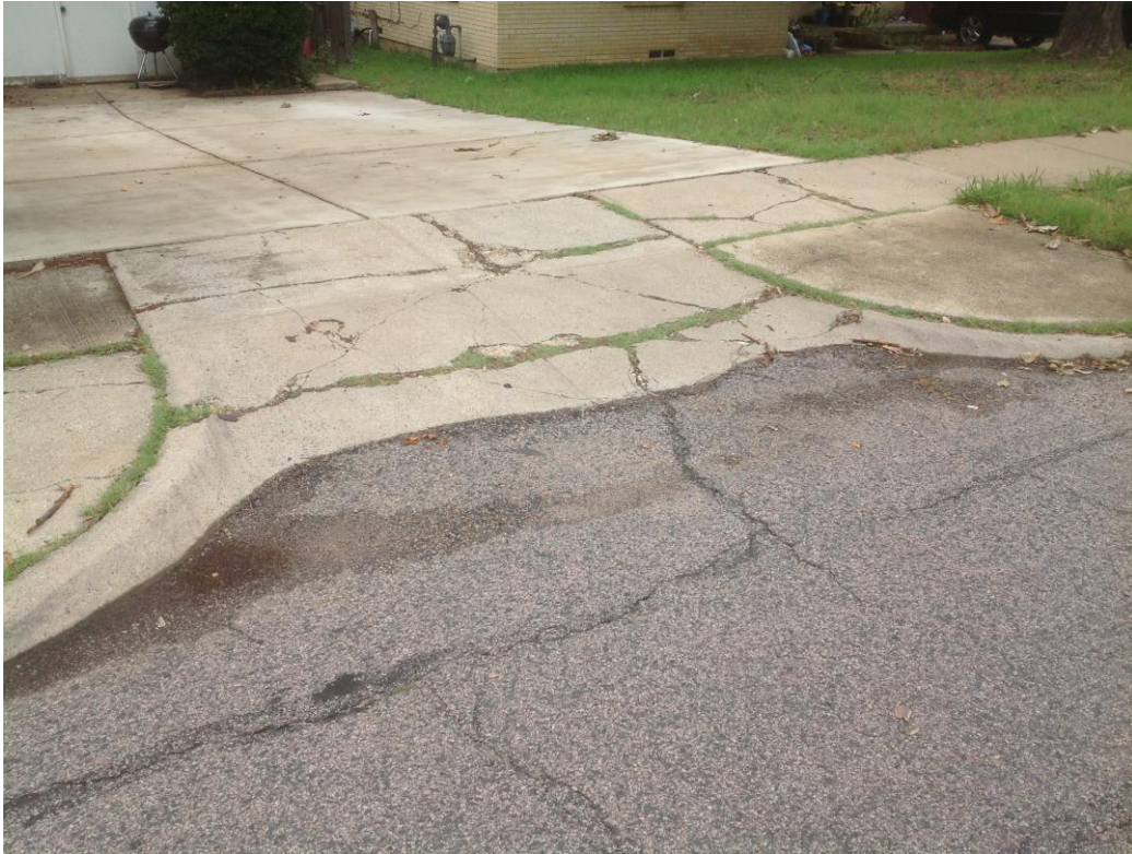
Multiple pavement cuts and sunken pavement