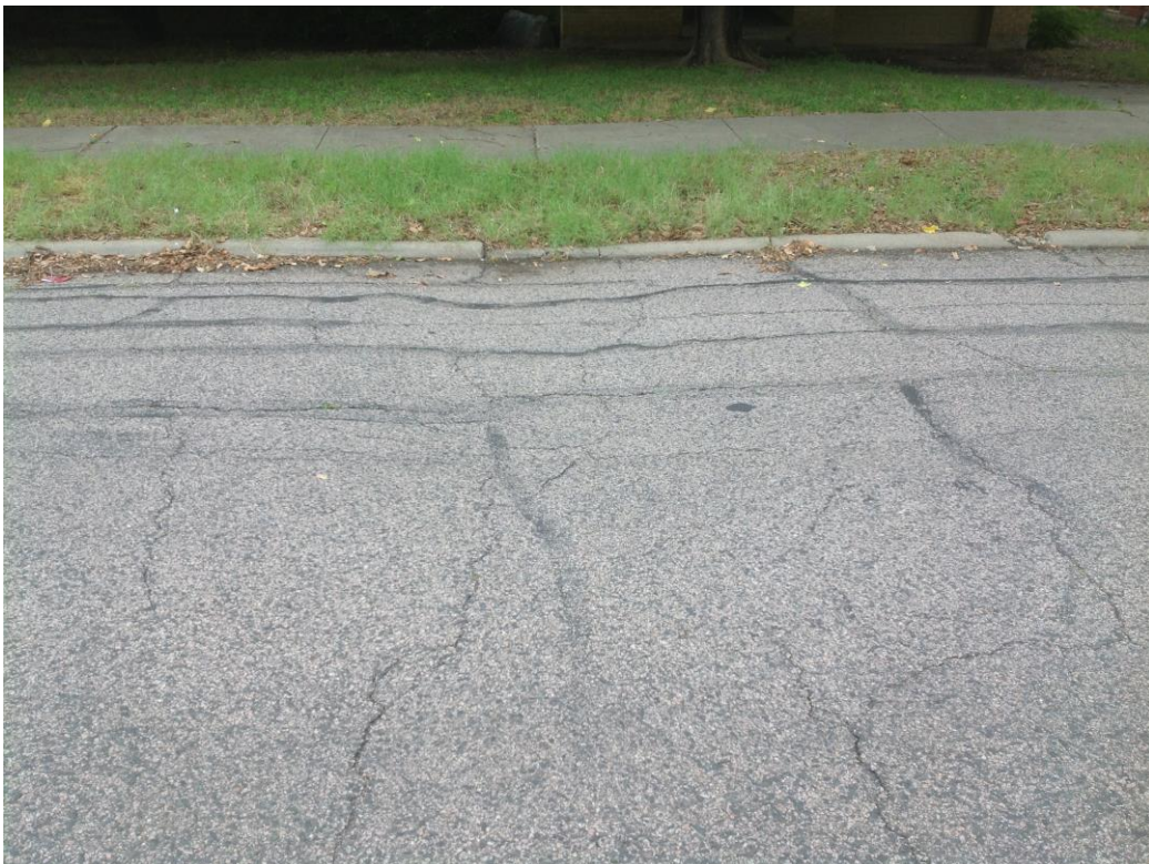
Asphalt raveling with pavement faults underneath