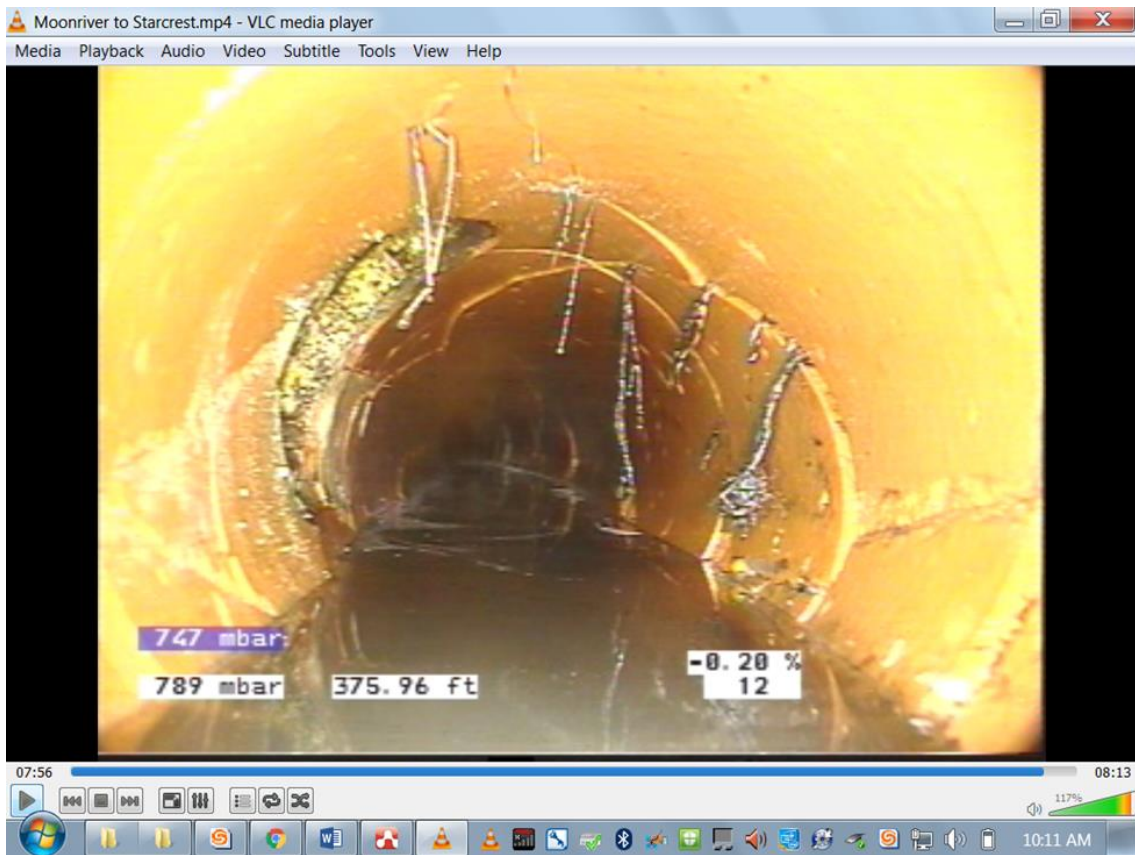
Inside of the Shoredale Clay Sewer Pipe