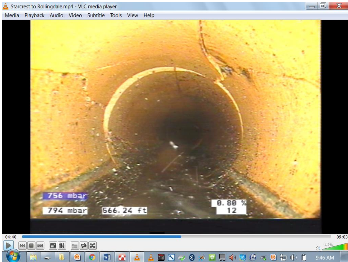
Inside of the Shoredale Clay Sewer Pipe