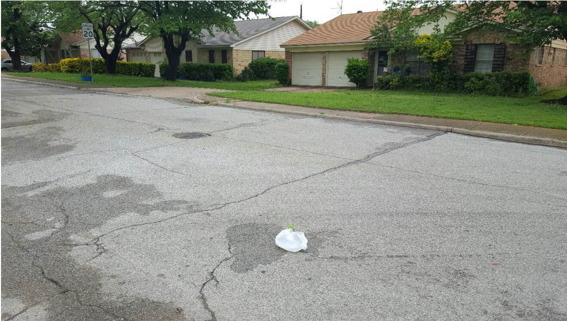
Shoredale Street View