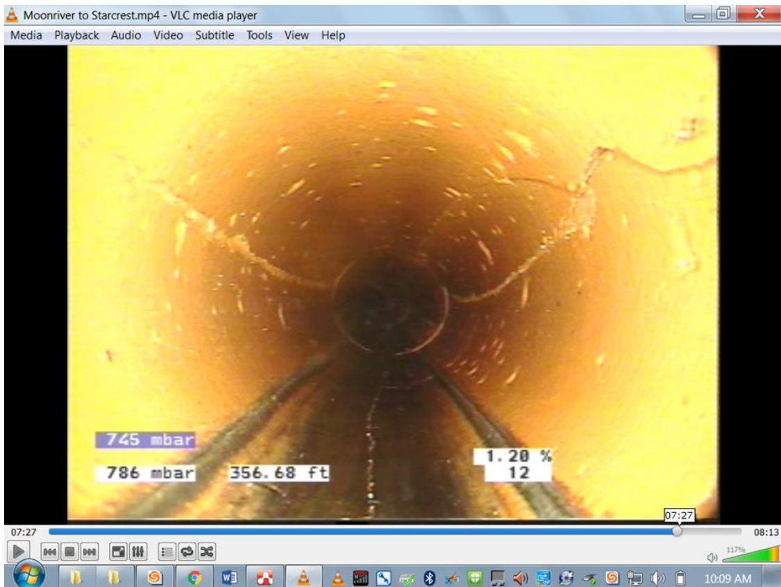
Inside of the Shoredle Clay Sewer Pipe