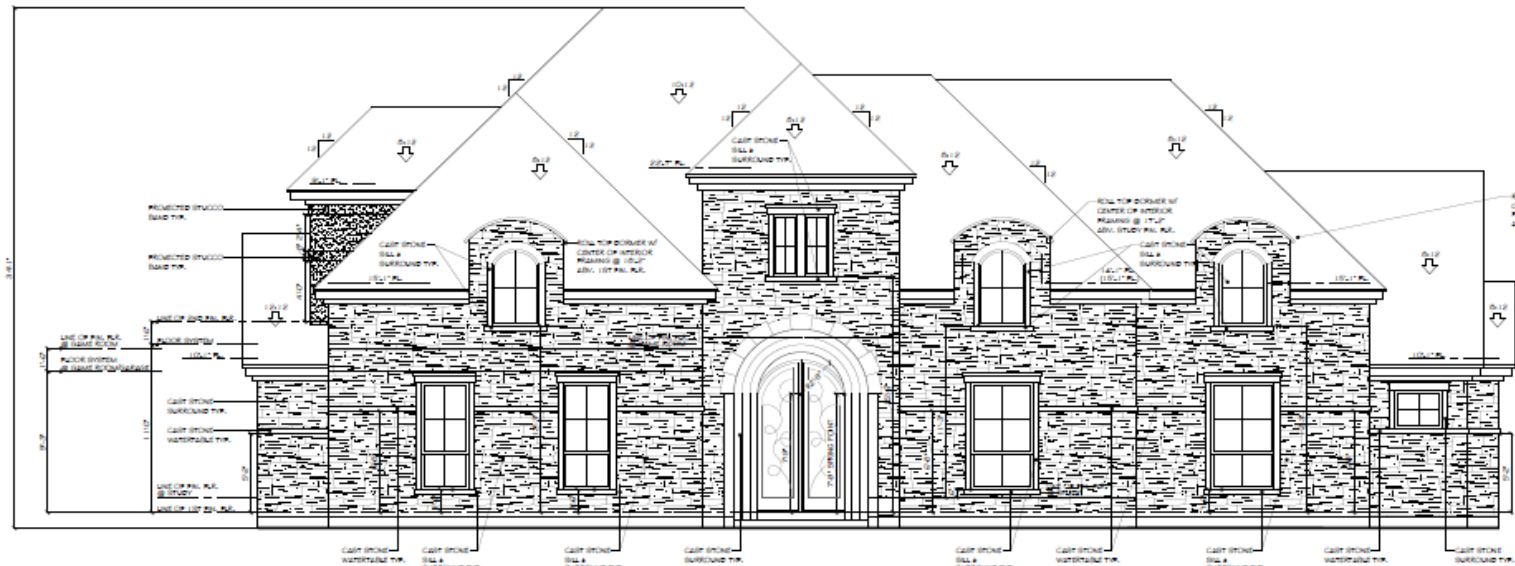
EXTERIOR MATERIALS LEGEND