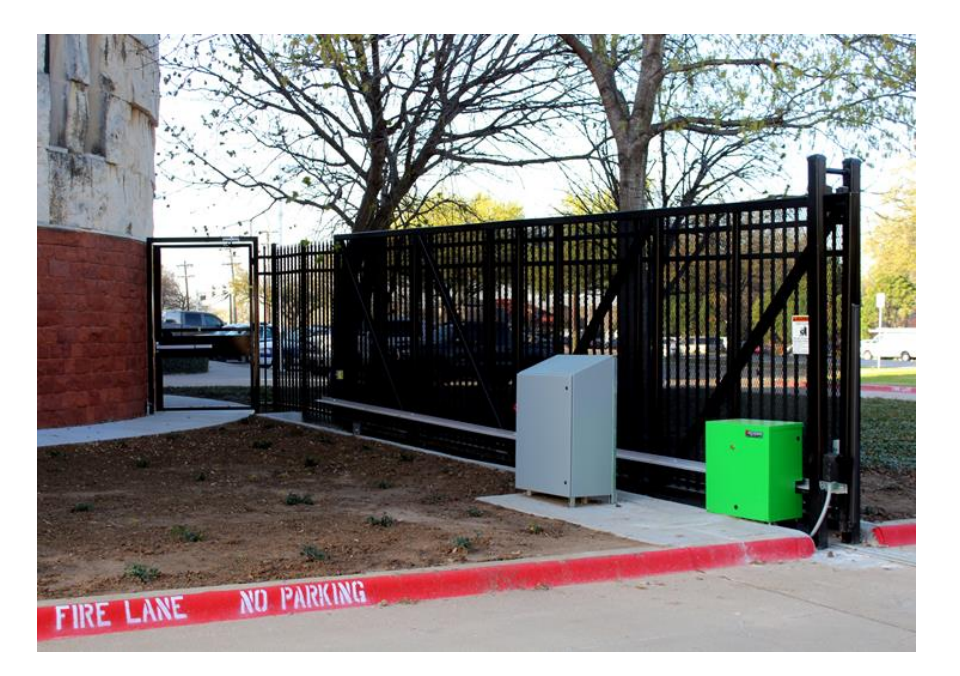
Marsh Lane Gate