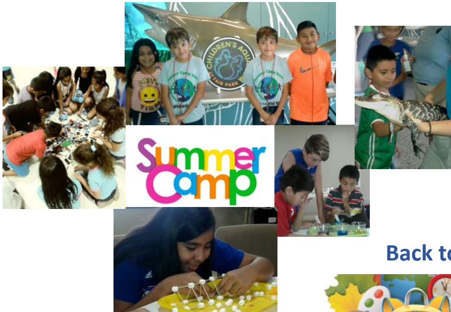
Back to School