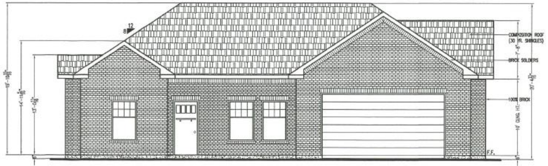
MAIN ELEVATION (100% BRICK)