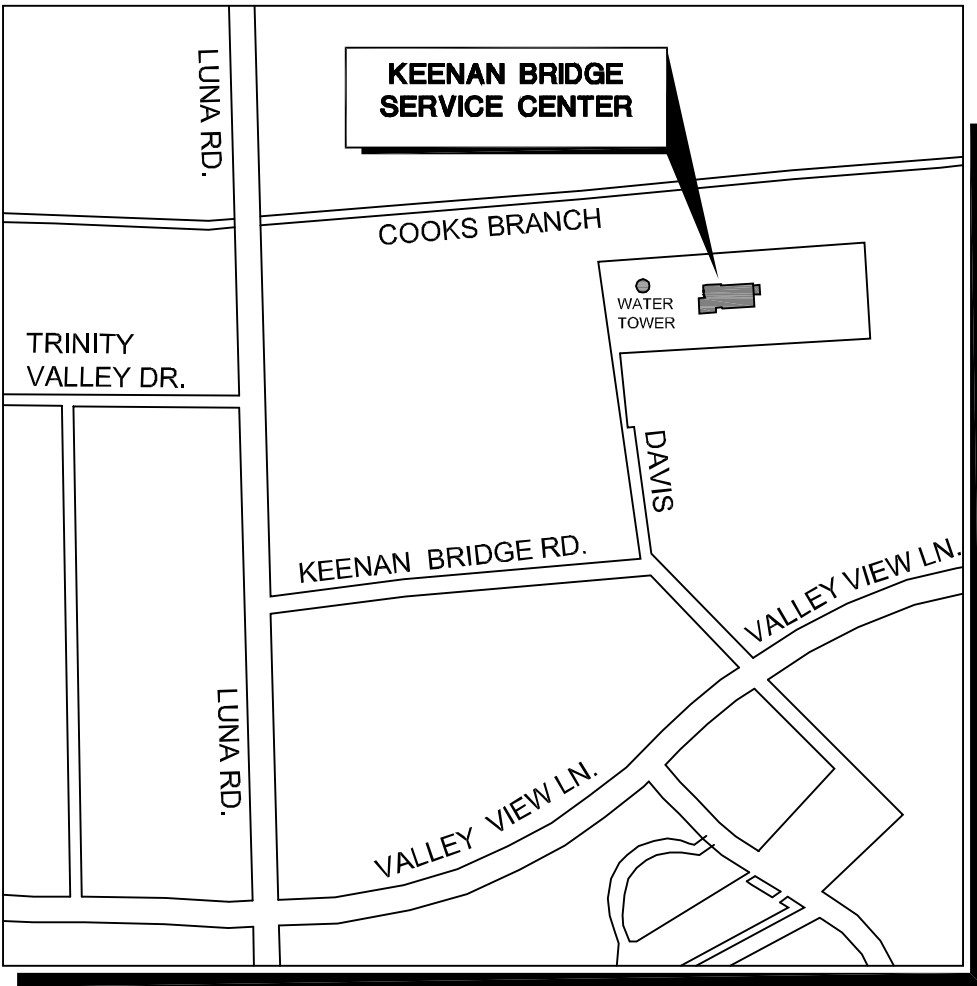
LOCATION MAP SCALE: N.T.S.